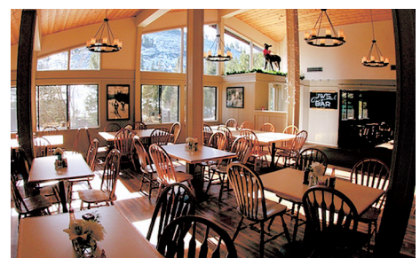
Shaver Lake Restaurant - At The Point

Shaver Pub 'n Grub has atmosphere, drinks, fish & chips, burgers, pastrami sandwich and more.