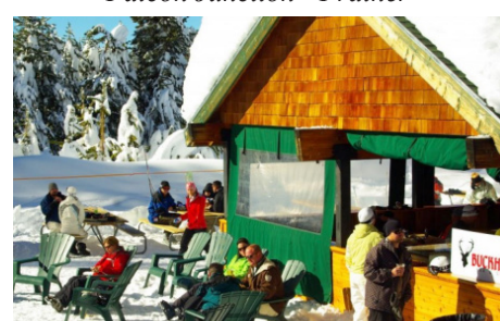
Buckhorn Bar and Grill