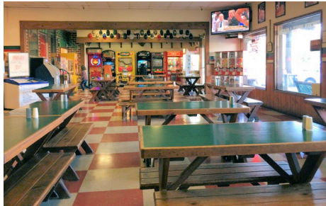
Pizza Factory - Prather