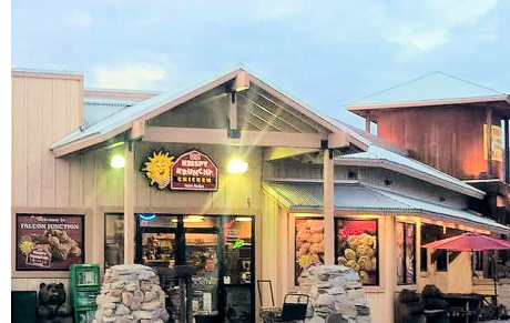
Falcon Junction - Prather