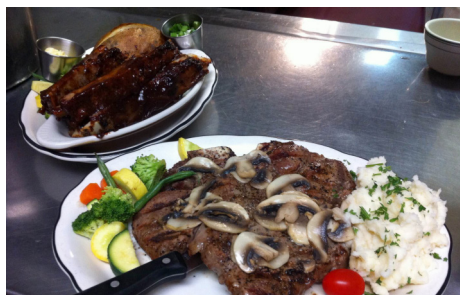
The Trading Post