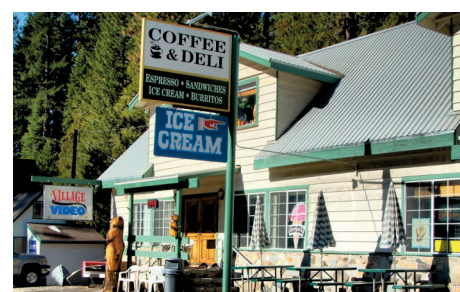
Shaver Lake Deli