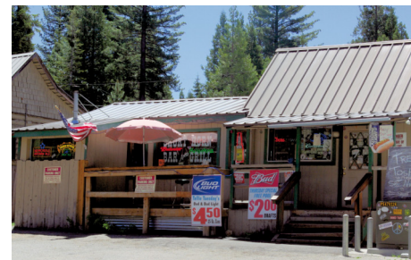
Short Horn Bar and Grill