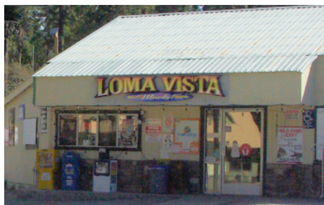
Loma Vista Food Mart and Fuel