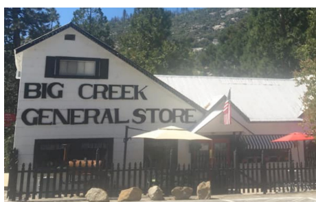
Big Creek General Store