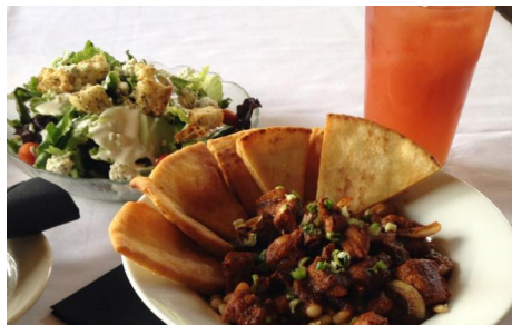
The Inn at China Peak Restaurant