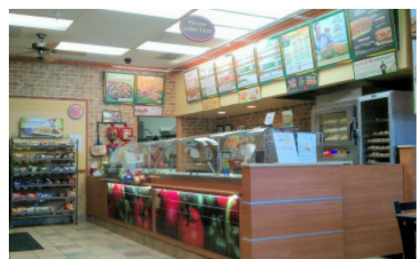
Subway Sandwich Shop - Prather

Shaver Lake Coffee and Deli offers chunky bread, grab and go burritos and a variety of deli lunch items. Several coffee drinks are available. Sit indoors or outdoors. (559) 841-3555.