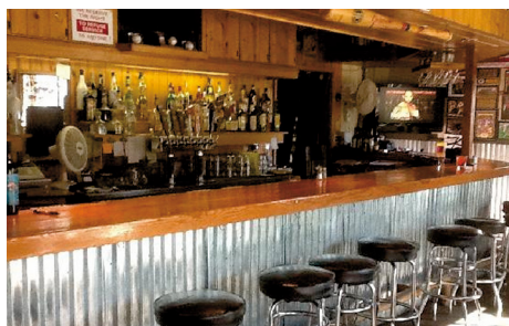
Shaver Pub 'n Grub