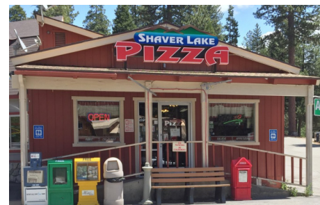
Shaver Lake Pizza