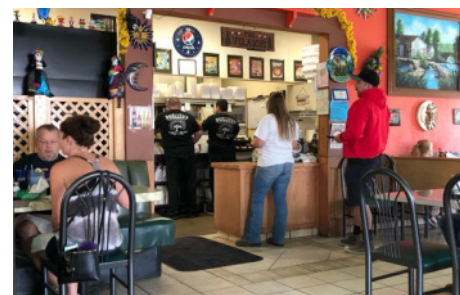
Velescos Mexican Restaurant - Prather